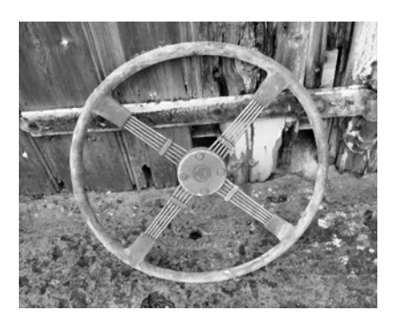
The steering wheel from Bader's MG TA.