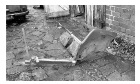
Two views of all that is left of the rear nearside quarter of Bader's MG TA.