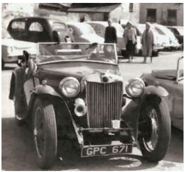
GPC 671 before the ac-