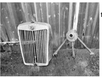
the radiator surround and spare wheel tripod from Bader's MG TA

The offside bonnet side of Bader's car showing the damage inflicted (most of the damage was further back as the Ford Cortina hit the car amidships as the MG was making a right turn).